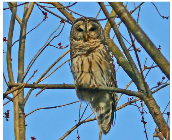
Barred Owl at Eakin Park.