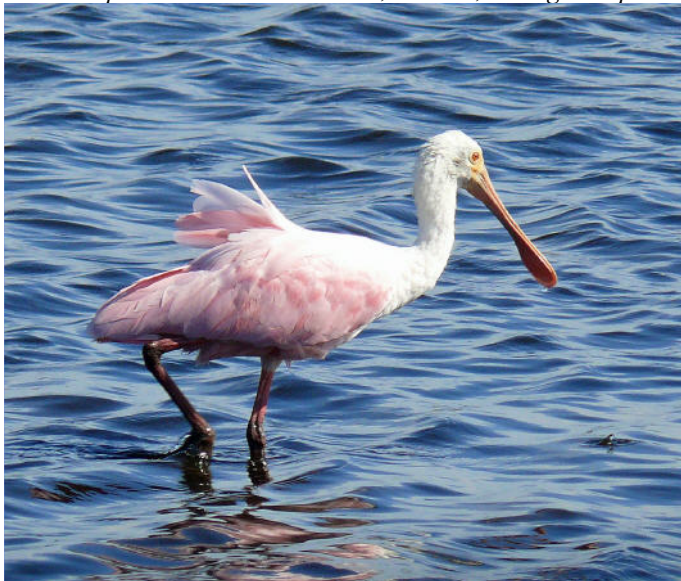
Roseate Spoonbill at Merritt Island, Florida, during the Space Coast Birding Festival.