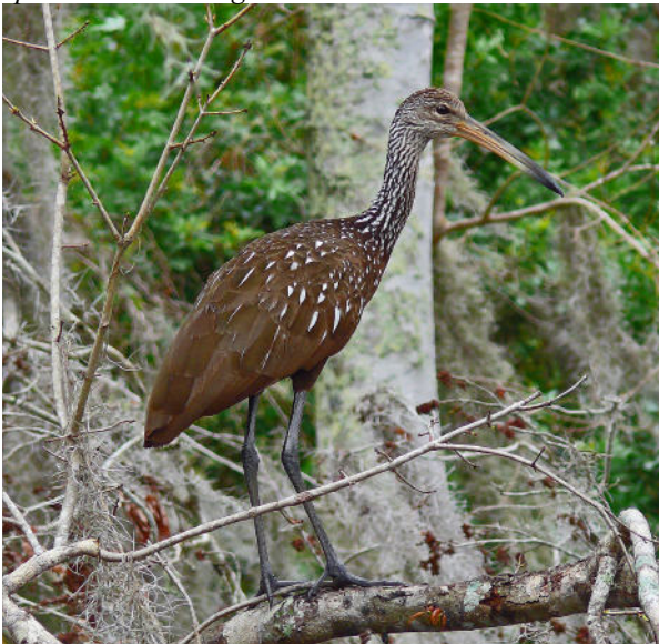
Limpkin at Lake Marian, Florida, photographed at the Space Coast Birding Festival.