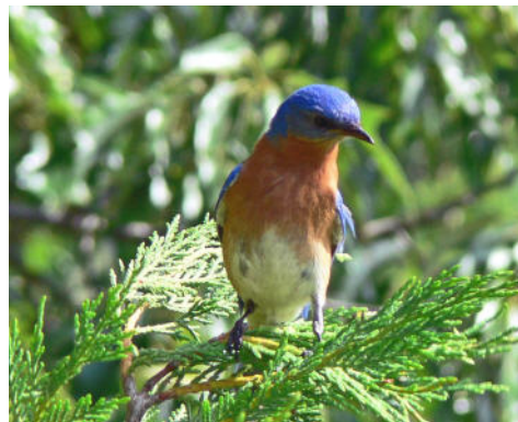
Male Eastern Bluebird.