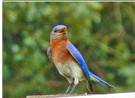
Eastern Bluebird at Occoquan Bay NWR.