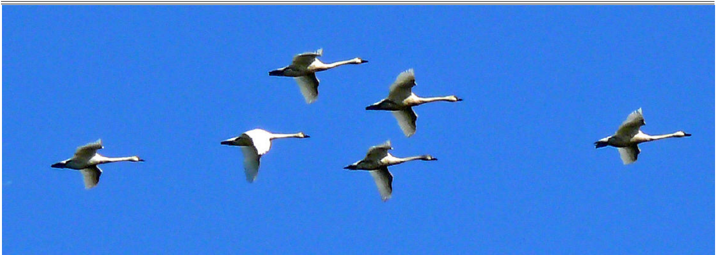
Tundra Swans at Pohick Bay