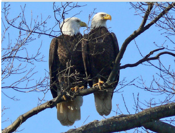
Bald Eagles at Pohick Bay.