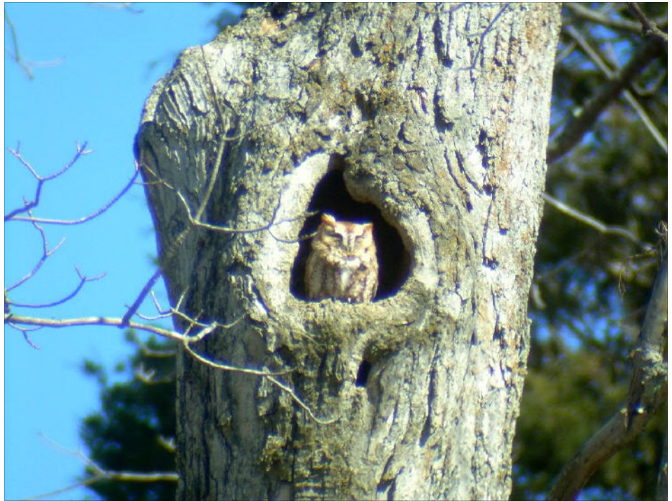
Eastern Screech-Owl in Highland County.